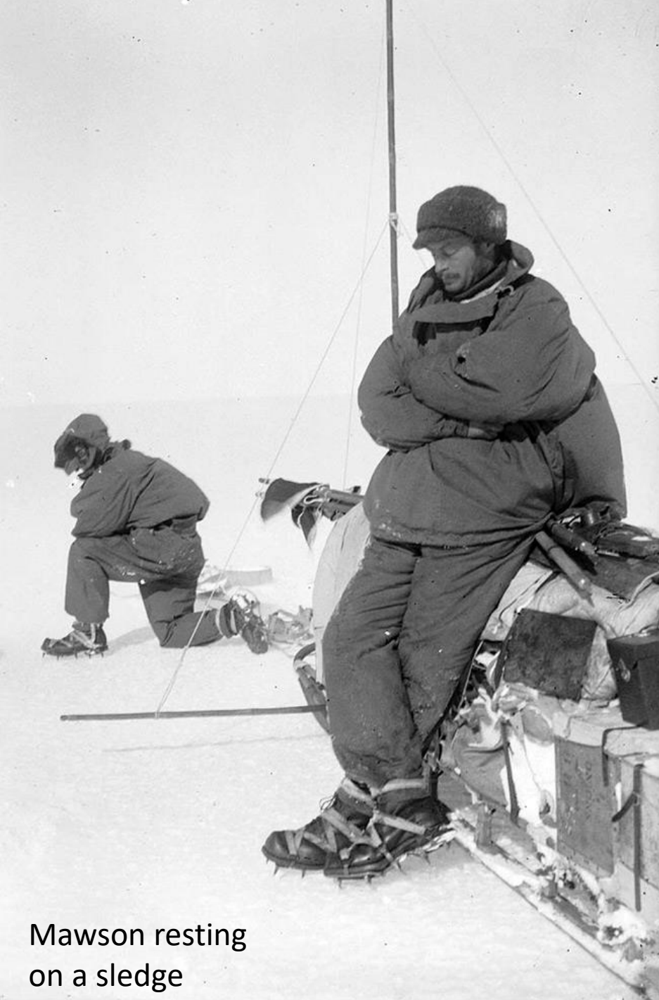
Mawson resting on a sledge

Mawson was invited by Captain Scott in 1910 to join the prestigious British Terra Nova expedition but declined and chose instead to lead his own Australian Antarctic Expedition to the region of Antarctica immediately south of Australia, almost totally unexplored at the time.