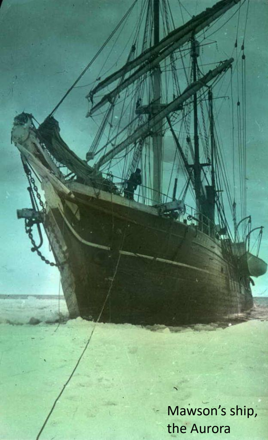
Mawson's ship, the Aurora

In spite of these tragedies, the Australasian Antarctic Expedition is today regarded as one of the greatest polar scientific expeditions ever because of the detailed observations in magnetism, geology, biology and meteorology that were made.